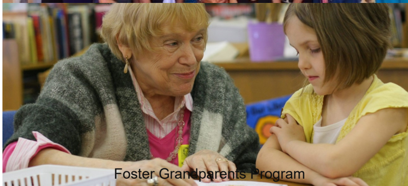
Foster Grandparents Program