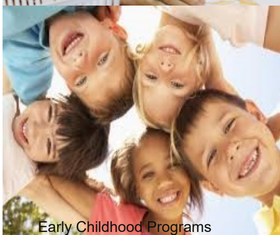
Early Childhood Programs