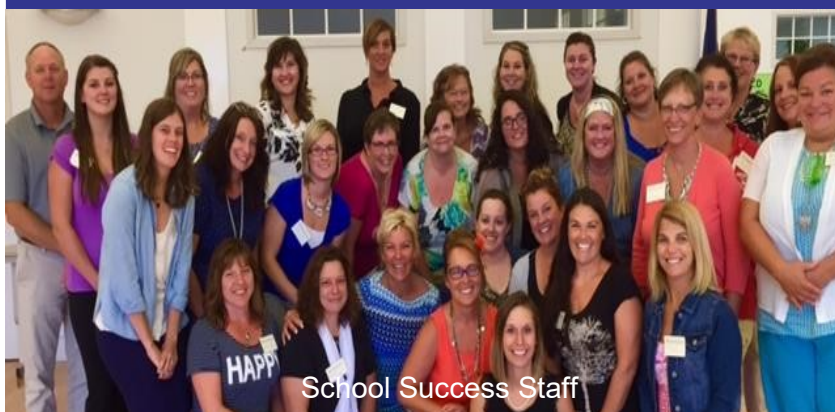
School Success Staff