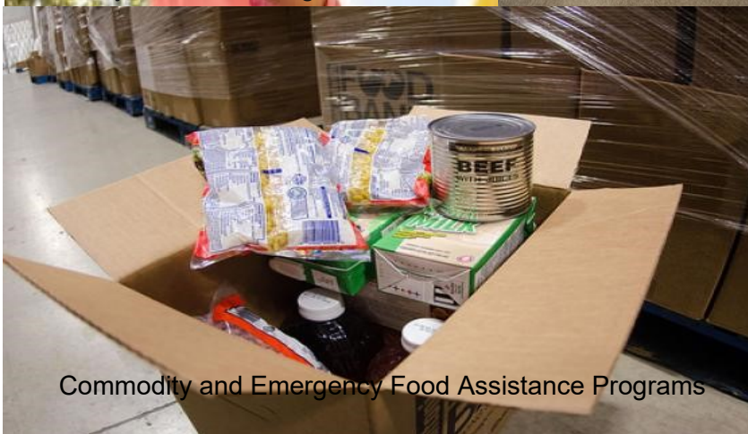
Commodity and Emergency Food Assistance Programs