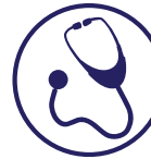
Private Duty Nursing