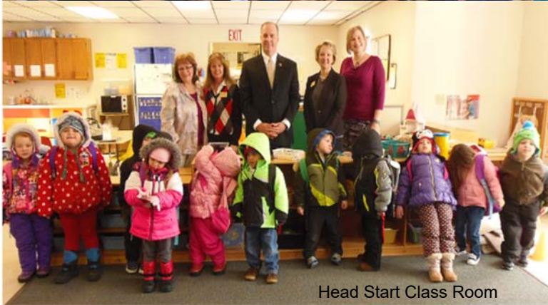
Head Start Class Room