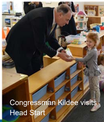
Congressman Kildee visits Head Start