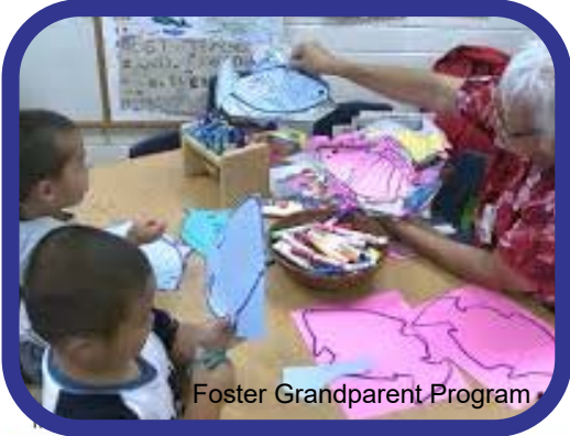
Foster Grandparent Program