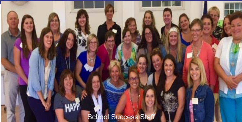
School Success Staff