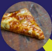
Favorite Food: Leftover Pizza for Breakfast