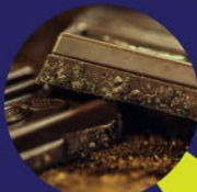
Favorite Food: Chocolate