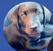
Favorite Pet: My Dogs - Finley & Rizzo