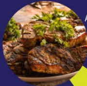
Favorite Food: Steak and Sushi