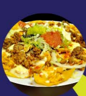
Favorite Food: Mexican