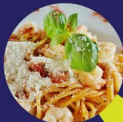
Favorite Food: Italian Anything!