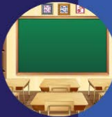
Childhood Dream Job: Teacher