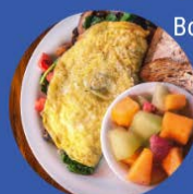
First Job: Bob Evans