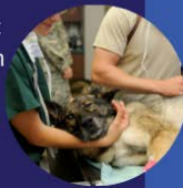
Childhood Dream Job: Veterinarian