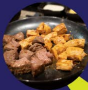
Favorite Food: Steak Hibachi