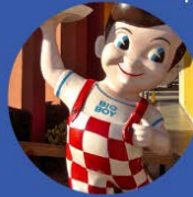
First Job: Hostess at Big Boy