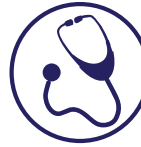
Private Duty Nursing