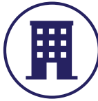
Adult Day Care